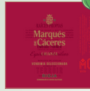
Marqués de Cáceres