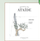
Quinta do Ataíde