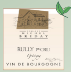
Domaine Michel Briday