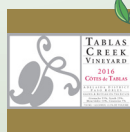
Tablas Creek Vineyard