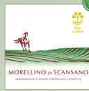
Doga delle Clavule