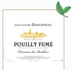
Domaine des Berthiers