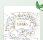
Ernesto Catena Vineyards Siesta