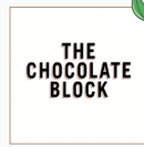
The Chocolate Block