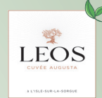
Domaine de LEOS