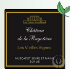
Château de la Ragotière