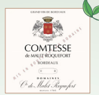
Domaines Comte de Malet Roquefort