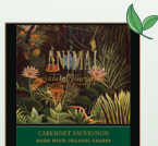
Ernesto Catena Vineyards Ánimal