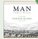
MAN Family Wines