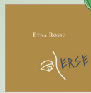
Tenuta di Fessina