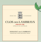
Domaine des Lambrays