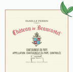
Château de Beaucastel