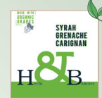
Hecht & Bannier